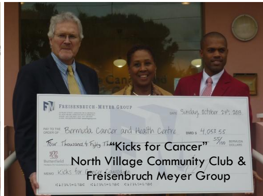
North Village Community Club & Freisenbruch Meyer Group