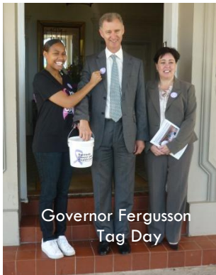
Governor Fergusson Tag Day