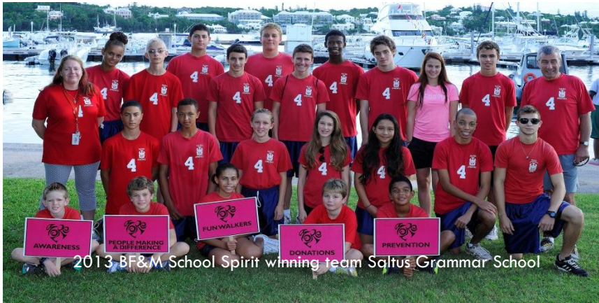
2013 BF&M School Spirit winning team Saltus Grammar School