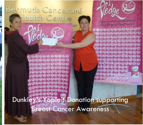
Dunkley's Yoplait Donation supporting Breast Cancer Awareness