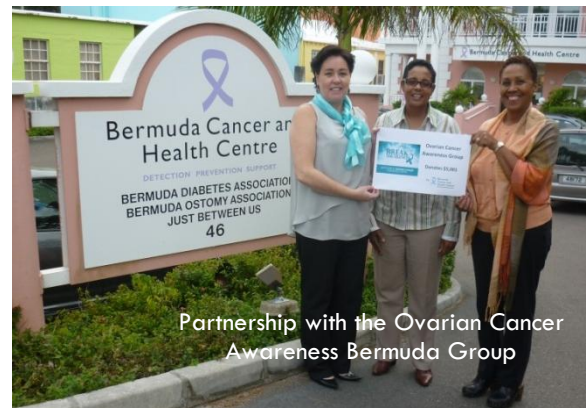
Partnership with the Ovarian Cancer Awareness Bermuda Group