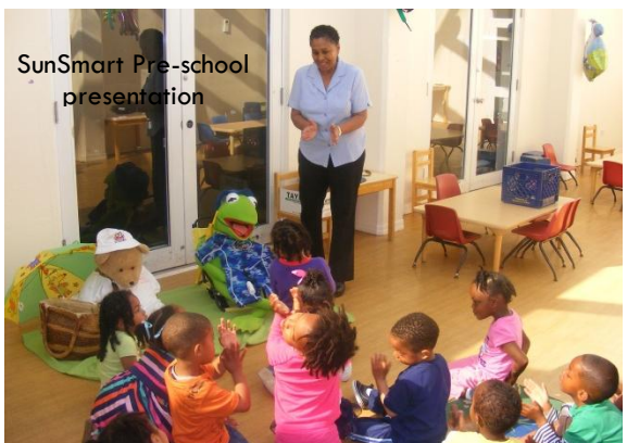
SunSmart Pre-school presentation