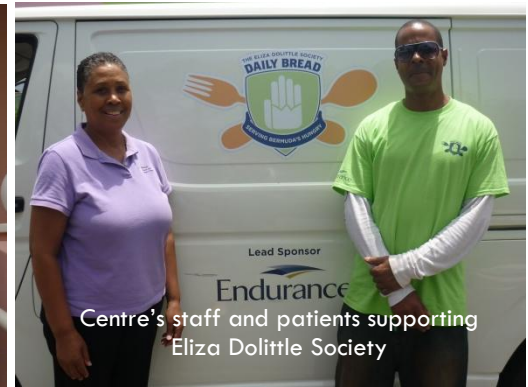
Centre's staff and patients supporting Eliza Dolittle Society