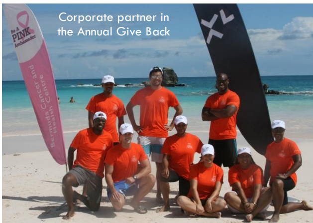
Corporate partner in the Annual Give Back